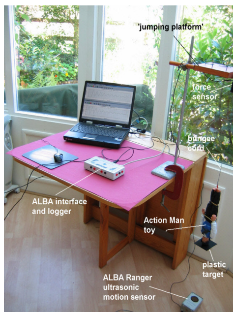
Figure 1 Bungee jump setup with Force sensor and the ALBA Ranger ultrasonic motion sensor